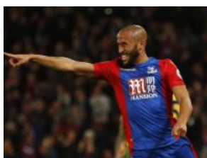
Allardyce factor the difference for Palace, says Townsend