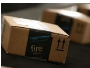
Amazon finds it hard to make friends it will crush later: opinion